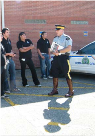
DTI students on tour of RCMP Training Depot