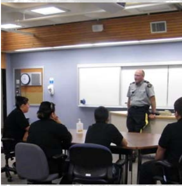
DTI students at an RCMP Training Depot classroom

In March of this year, 11 young women and men started the Aboriginal Law Enforcement Preparation program in Meadow Lake. The five month program is being offered by Dumont Technical Institute in cooperation with several community partners. Students earn an applied certificate that prepares individuals for employment in policing at the federal, provincial, or municipal level, as well as other law enforcement agencies.